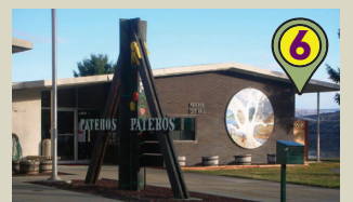
6 MUSEUM & VISITOR CENTER Local History on Display Exhibits Include: Old Pateros, Wells Dam, The Fruit Industry, Fur Trade, Fort Okanogan, Pateros Schools & Sports, Steamboats, & 2014 Carlton Complex Fire.