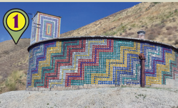
Water Tower Art (reflector) Mural by Richard C. Elliot (1992) Re-installation (2016) A must see at night You can light it up with a flash light