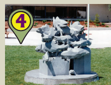
4 Pateros Schools Home of the Billy Goats (Follow the Tracks) Home of Richard Beyer's Sculpture "Fish Swimming over Old Pateros"