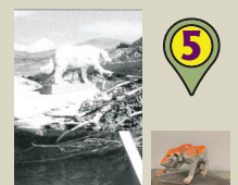
5 Billy Joe Sloan, the Fishing Dog Sculpture by Richard C. Elliot (1995) On large rock in Columbia river 1 Mile south of town by boat Prototype in Pateros Museum