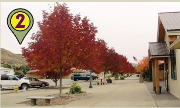
Pateros Mall - "Our Main Street" Designed by Mid-Century Architect Don Hollingsberry Pedestrian access to post office & library retail, and restaurant businesses